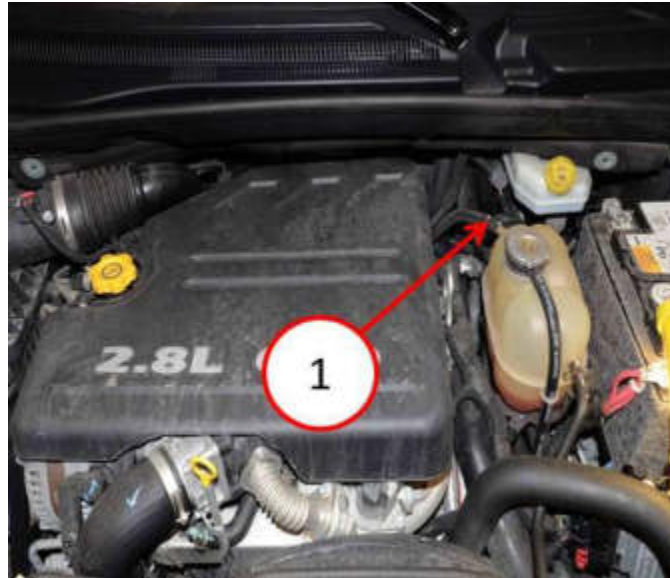
Fig. 1 Differential Pressure Sensor Location - Engine Compartment Location

1 -Differential Pressure Sensor Location