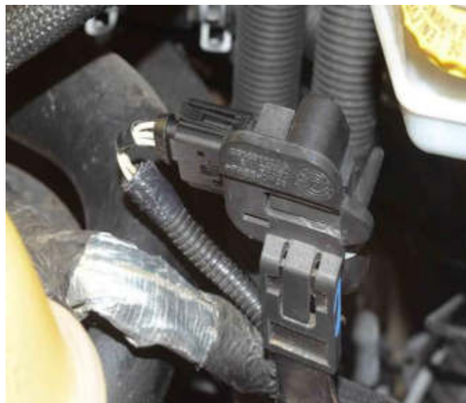
Fig. 4 New Differential Pressure Sensor Reinstalled